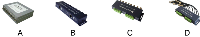
08 Channel Passive CAT5E Video Transceivers